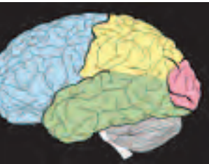
The lobes of the cerebral cortex include the frontal (blue), temporal (green), occipital (red), and parietal lobes (yellow). The cerebellum (not colored) is not part of the telencephalon.

To solve the puzzle you must figure out how to place the numbers 1 to 9 exactly once each in every row, column, and 3 x 3 box in the grid